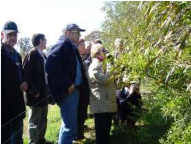
September: National PFDC Workshop around Katanning - PFDC, state government and industry representatives look at developments in Western Australia and what farm forestry can mean in really low rainfall areas.