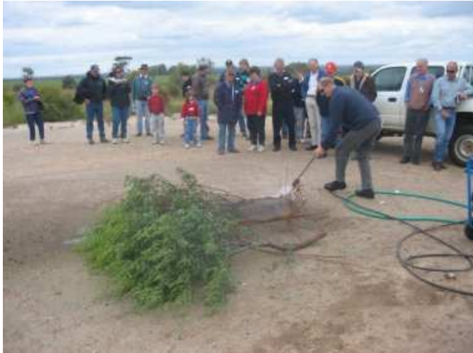
Wednesday 28 th September: “Avon Sandalwood Network (ASN) AGM and Spring Field: Day” The 5 th field day and workshop of the ASN was held in Cunderdin, attended by 62 people. Topics during the workshop covered included yield estimations, direct seeding, nut research and various industry issues. During the field day various plantations were inspected in the Tammin area.