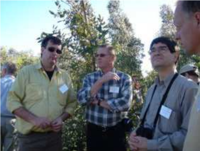
August: International Bioenergy Workshop and Field Trip - International scientists looking seriously at woody perennials for power generation.