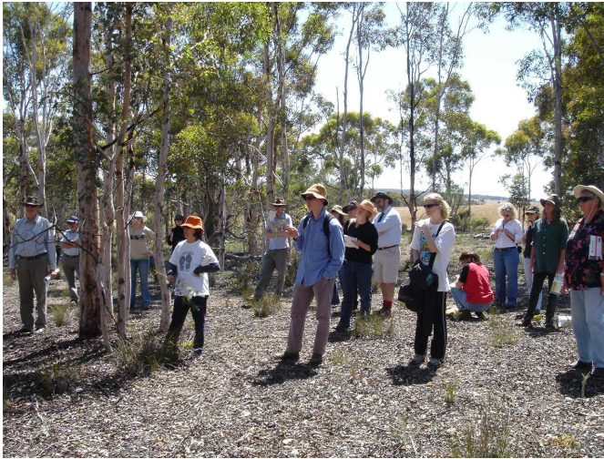
Friday 11 th November: Private Native Forest Management Field Day - An enthusiastic group of almost thirty people visited two properties as part of the first Private Native Forest Management Field Day in the Avon Region. Two sites were visited, a wandoo site in the morning and a jarrah site in the afternoon. Participants were local government, industry and land holder representatives interested in learning how to sustainably manage bush on private land - combining conservation and wood production. This day was funded by the Joint Venture Agroforestry Program

If there is interest or a need for a specific Field Day in your area, please contact Monica Durcan (details below)