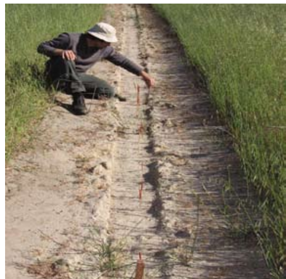
Assessing seedling emergence. Note red topped markers indicate the location of emerged seedlings.