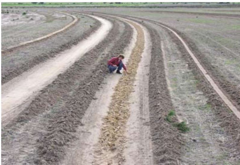
Trialling different site preparations and water harvesting environments to improve direct seeding success at Ian Hall's farm.

This research is funded by JVAP and various industry partners including funding from Lotterywest via AVONGRO and is delivered through the Future Farm Industries CRC and its partners.